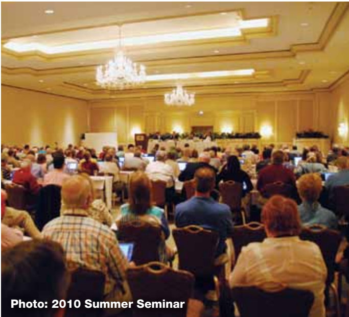
Photo: 2010 Summer Seminar

ACTEC will provide seminar materials online for $225 or print materials for $250. Materials may be ordered using the enclosed registration form.