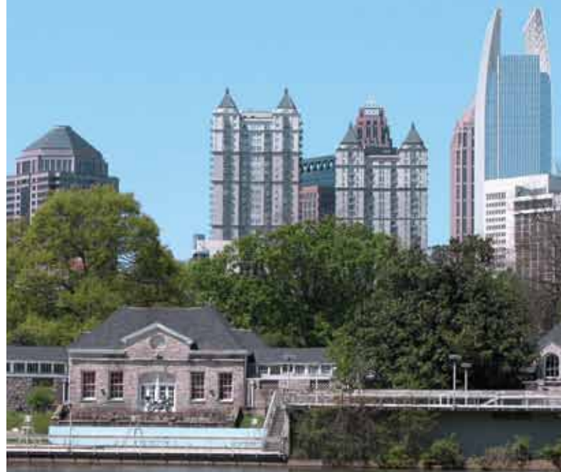
Atlanta skyline as seen from Piedmont Park

ACTEC tours fill up quickly, so send in your registration as soon as possible.